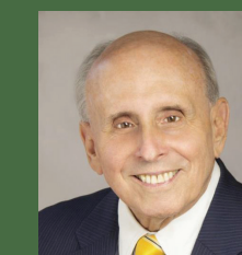
Raúl Valdés-Fauli Mayor